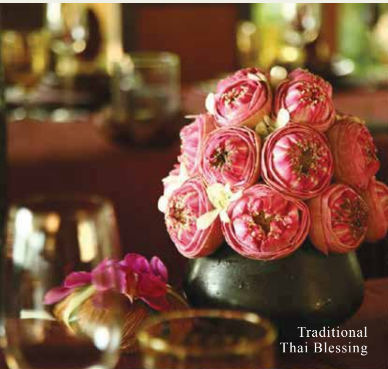
Traditional Thai Blessing