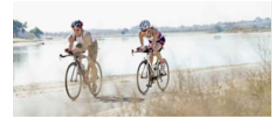
WALKING, CYCLING, AND JOGGING 00971 6 701 4700 / info@alzorah.ae www.alzorah.ae