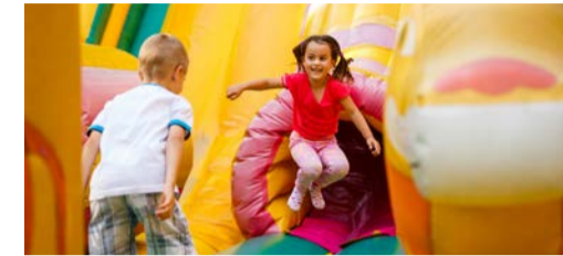
FUNTASTICO 00 971 4 334 2660 / funtastico@leisuretechgroup.com www.leisuretechgroup.com