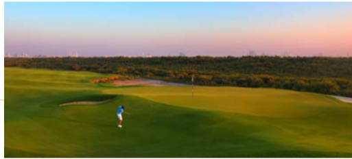
AL ZORAH GOLF CLUB 000971 6 701 4780 / golfreservations@alzorahgolfclub.ae www.alzorahgolfclub.ae