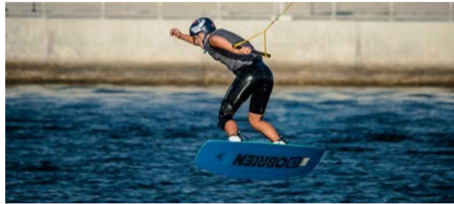
ADVENTURE LEISURE TIME 00971 56 631 8593 / 00971 56 542 5595 alzorah@altdubai.com / www.altdubai.com