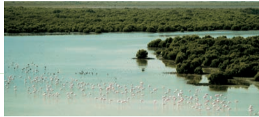
AL ZORAH MANGROVE RESERVE 00971 6 701 4700 / info@alzorah.ae www.alzorah.ae