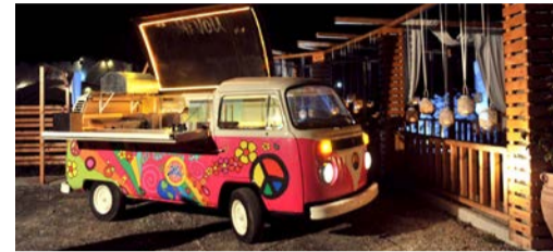
GROOVY PARK 00971 54 340 0245 info@envisiondwc.com