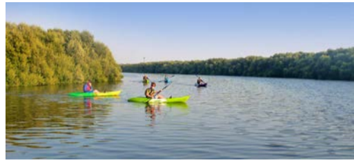
QUEST FOR ADVENTURE 00971 58 567 0730 / info@questforadventure.net www.questforadventure.net