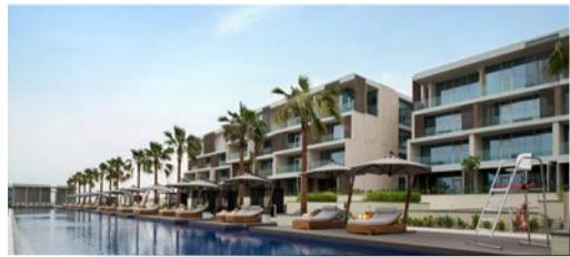
THE OBEROI BEACH RESORT 00971 6 504 4888 / contact.toaz@oberoihotels.com www.oberoihotels.com

ABRA SIGHTSEEING TOURS - PEARLING - GOLF - MARINA YACHT CHARTER WATERSPORTS - FAIRGROUND RIDES - EDUCATIONAL ADVENTURE PACKAGES MANGROVE FOREST EXPLORATION