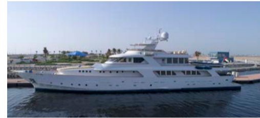
NORDIC STAR 00971 6 701 4754 alzorah@artmarine.ae