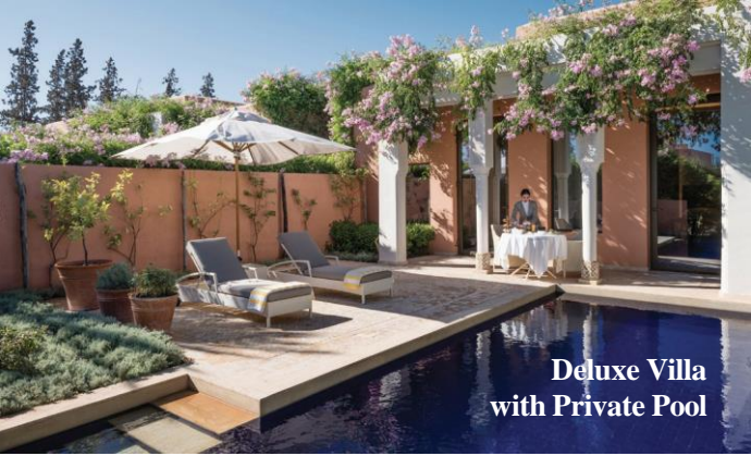
Deluxe Villa with Private Pool