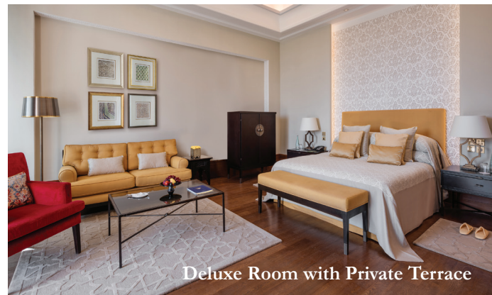
Deluxe Room with Private Terrace