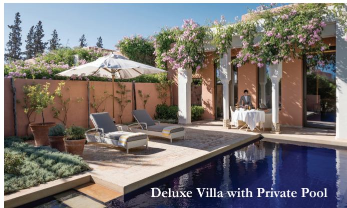
Deluxe Villa with Private Pool